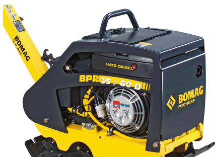
Robust and reliable Best component protection