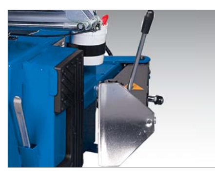
Bead breaker blade

Owing to its special shape the bead breaker blade handles rims most gently and facilitates operation considerably.