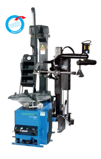
MONTY® 3550 Pneumatic tilt back post tyre changer for wheels up to 26" diameter