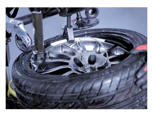
Simple Gentle demounting with the bead pusher.