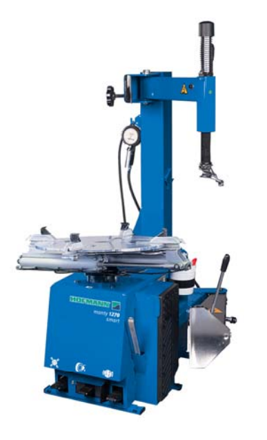
Table-top tyre changers with single speed