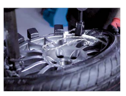
Optional smart bead spacer

For mounting UHP and run-flat tyres. The Smart Bead Spacer comes standard with the plus kit.