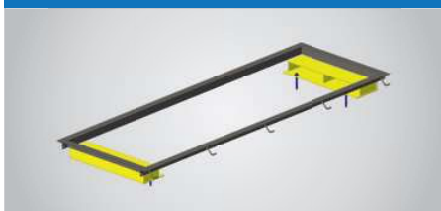
Flush Mount Kit