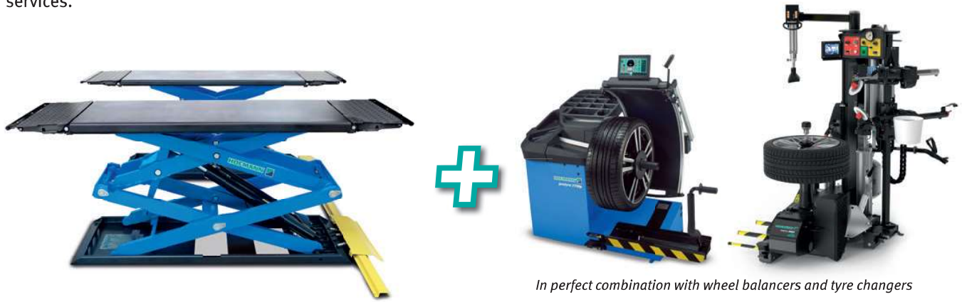
In perfect combination with wheel balancers and tyre changers