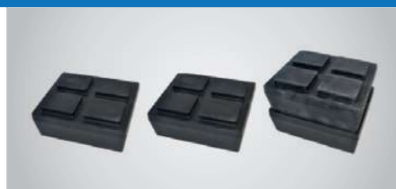
Stackable Interlocking Pads (1 set of 4) 1 Kit included in the scope of delivery