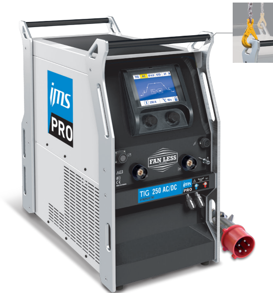
Supplied without accessory