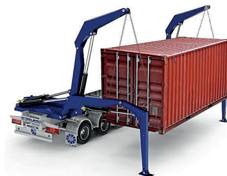
Transport and unloading of a full eTANK 20