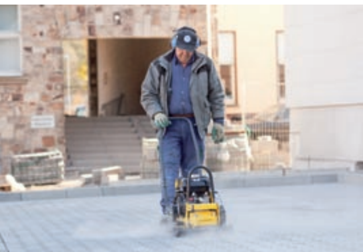
...and block paving.