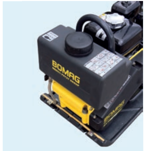
An optional water sprinkler system with 7 l tank capacity for asphalt work.

Smart design! The steering arm folds to simplify storage on warehouse shelves and for easier site-to-site transport.