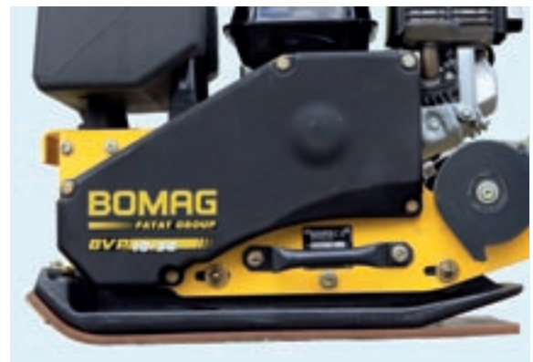
Plastic mat option for block paving work.