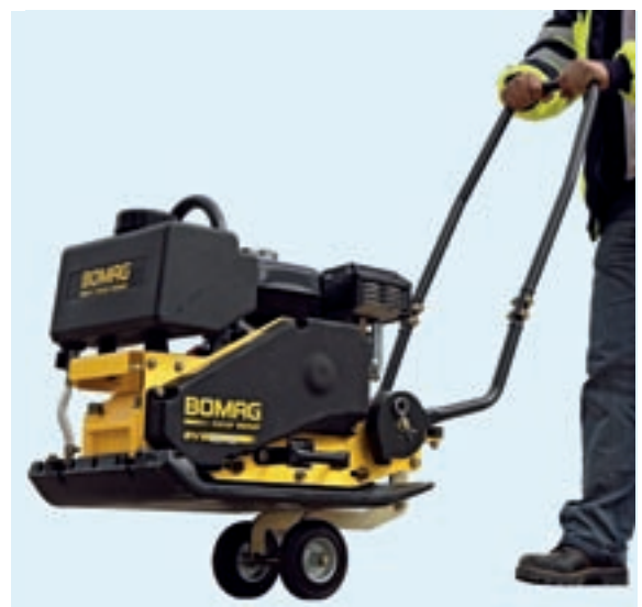
Transport wheels option for added mobility.