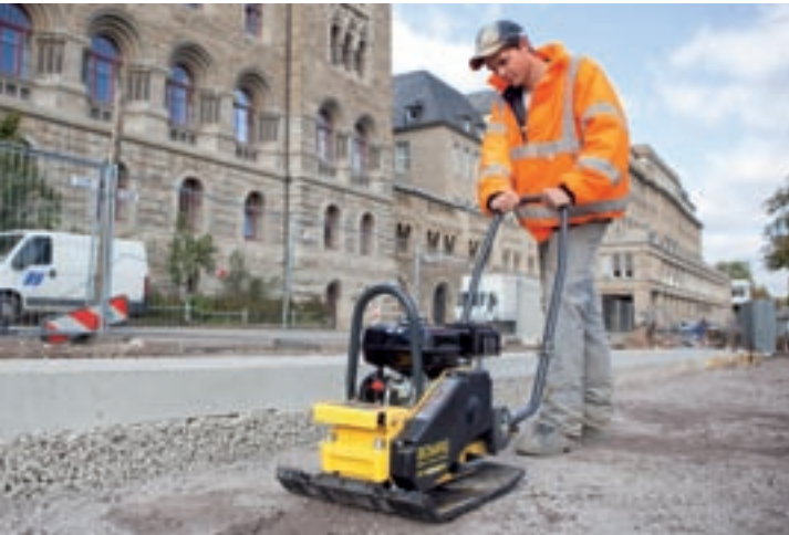
Dependable results on light duty work with soils and granular materials...