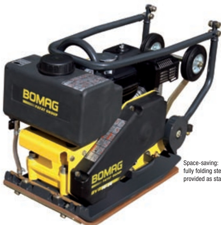
Space-saving: fully folding steering bow provided as standard.