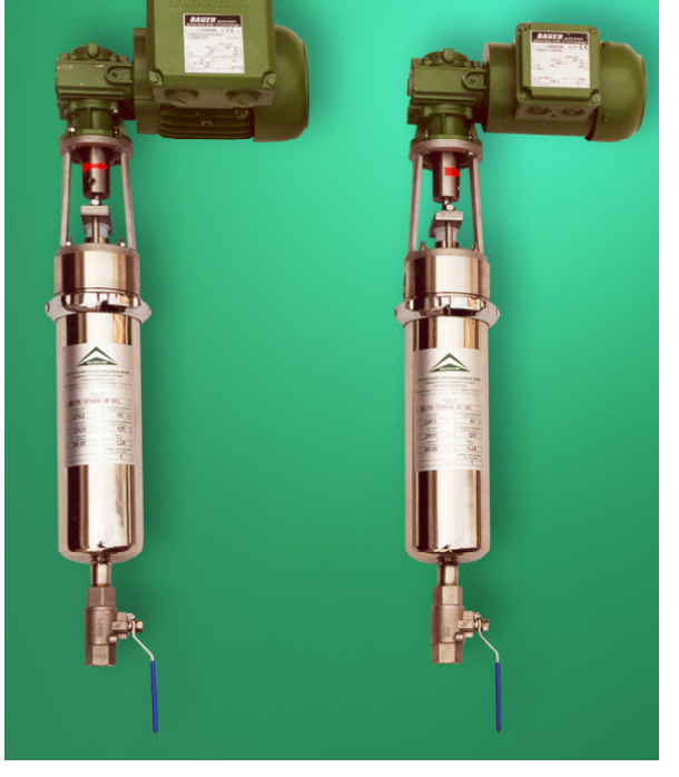
DELTA-STRAIN 35-D/L with EX-proved and normal motor

Electronics industry, Optic industry, Pulp & Paper industry, Leather industry, Steel industry, Wastewater and Water supply companies etc.