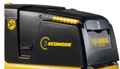
Higher quality, lower costs ECONOMIZER - The compaction display (optional)