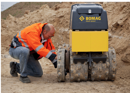
Flexible working widths Original BOMAG drum extensions